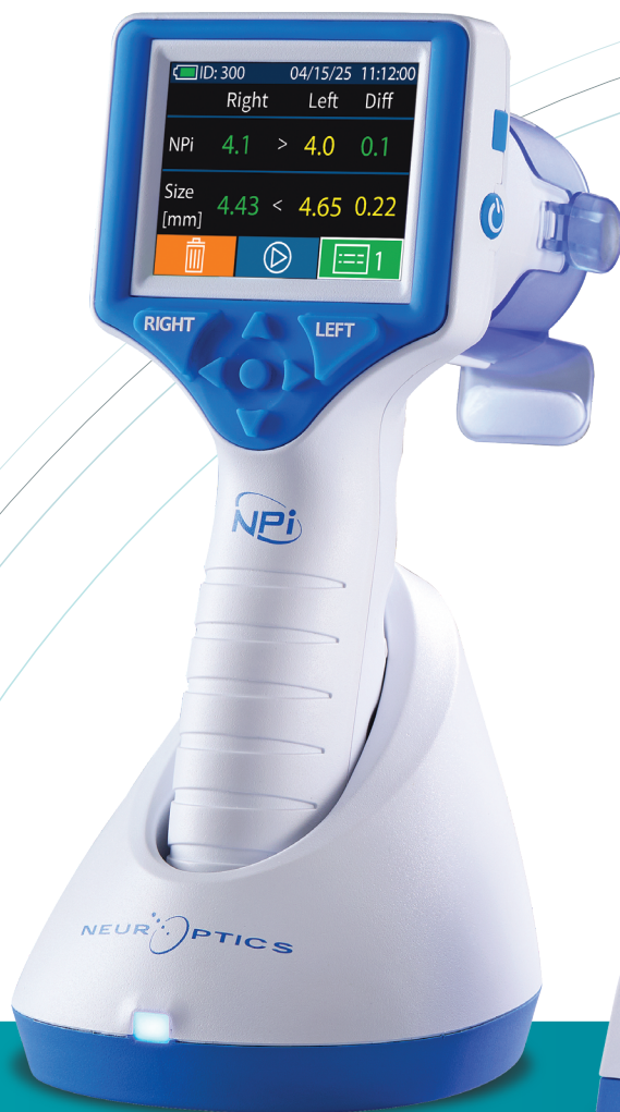
NPi®-300 Pupillometer and SmartGuard®

Simple EMR Integration for Trendable NPi®